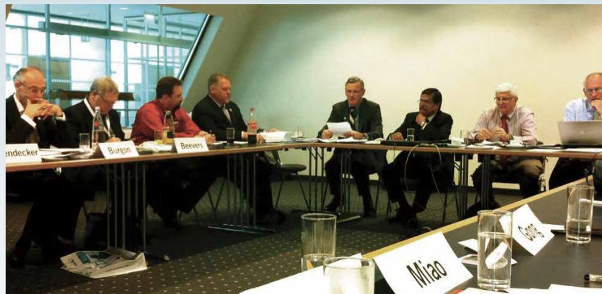
PMI takes part in the World Plumbing Council Summit