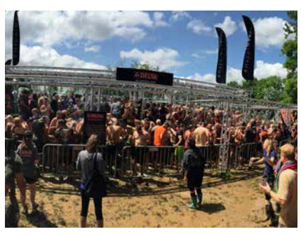
331 Warrior Dash participants enter the Delta Shower System to set the Guinness World Record for the most people showering simultaneously after the race

"We partnered with Warrior Dash to bring our HappiMess campaign to life and help participants tackle the roughest, muddiest, aspects of the course knowing Delta showers would