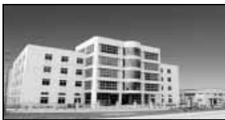
The JMI factory in Panyu County, Guangdong Province

From such humble beginnings has emerged a global company that is one of the industry's leading manufacturers in decorative and functional plastic and electroplating.