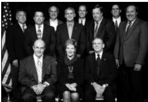
Thank you to the 2002 PMI Board of Directors shown here with Lt. Col. (ret.) Oliver North at the fall meeting.

With harmonized U.S. and Canadian products standards in place, we will be in a much better position to harmonize international provisions and realize our goal of "one test, one certification, recognized worldwide".