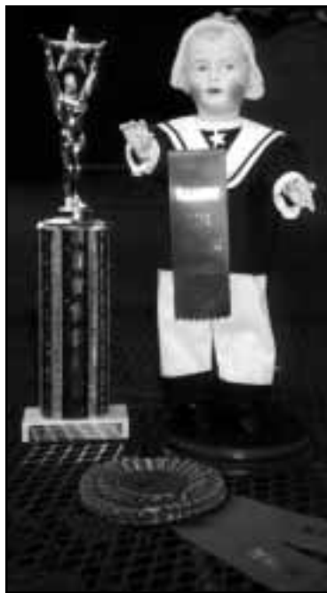
Best in show — "The Charmer"