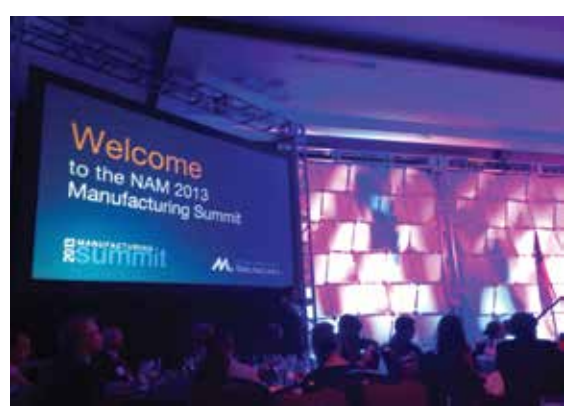
A record-breaking number of people attended the summit, including more that 500 manufacturers