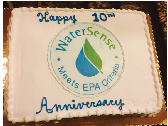
Let them eat cake! IETS conveners celebrate WaterSense's 10th anniversary, cake designed by PMI.

Immediately following IETS, the Plumbing Industry Leadership Coalition (PILC) 2 held their fifth annual meeting and moved to issue the a letter to water policymakers, legislators, and media noting the significance of WaterSense. The PILC letter may be viewed online here: goo.gl/qP8Pzv