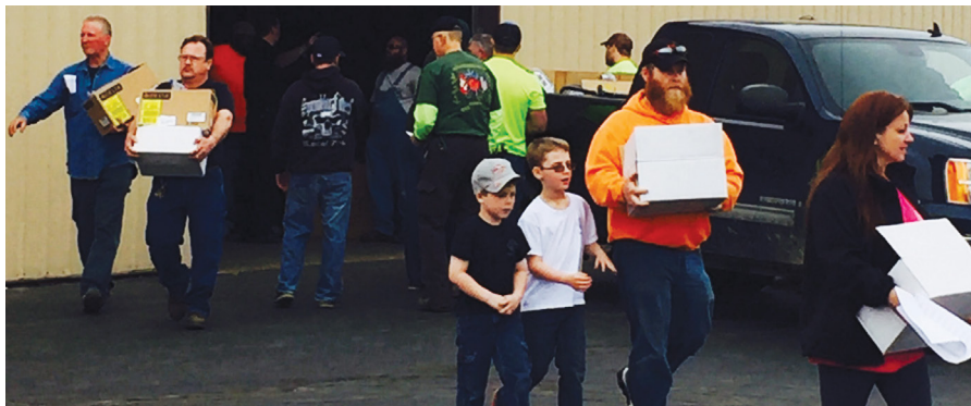
Entire families gathered together to help in the humanitarian effort.