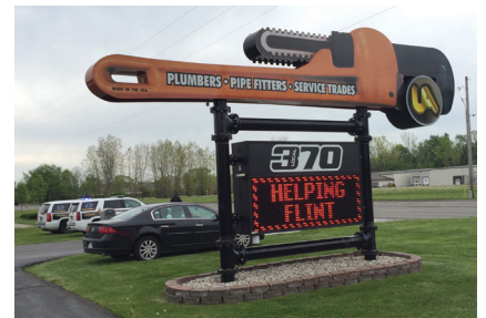
Learn more about the humanitarian project: youtu.be/N2WbNDdGgOQ