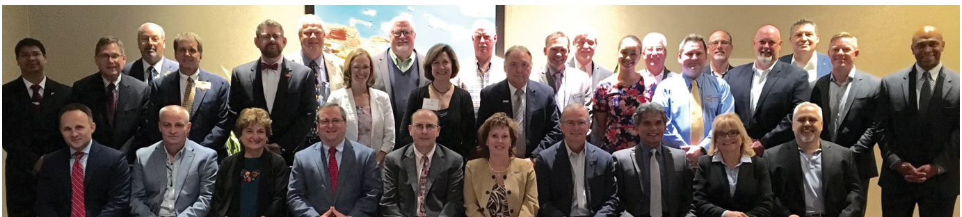
PILC leaders and special guests gather for their annual meeting in Rosemont, Illinois following IETS. Can you spot the PMI faces?