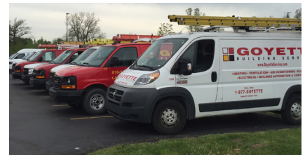
Plumbers from as far away as New Mexico gathered to help install products donated by PMI members to residents whose fixtures were not compatible with the filters.

Co., Delta Faucet Co., Fluidmaster Inc., Kohler Co., Moen Inc., Speakman Co. and Viega. Monetary donations were also made by Fisher Manufacturing and International Code Council. International Association of Plumbing and Mechanical Officials (IAPMO) was instrumental in helping coordinate the effort.