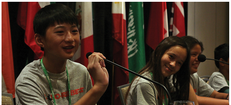
Roto-Rebels of Suzanne Middle School in Walnut, Calif., shared at EWTS how students use LEGOS to accelerate STEM learning and robotics