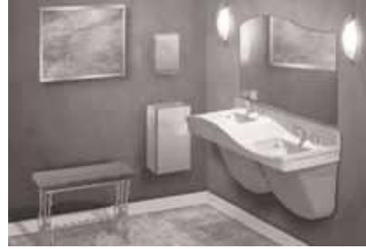
Trendy Bradley bathroom

Concern for the environment is also important to Bradley. While manufacturing quality commercial washroom fixtures, they are dedicated to conserving resources and preventing pollution. Bradley is a member of the U.S. Green Building Council and produces products that support LEED credits. Last May, Bradley's NDite technology, a light-powered lavatory system was approved by Building