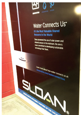
Official Water Efficiency Partner of the Chicago Cubs, Sloan promotes the value of water at restrooms throughout the ballpark.