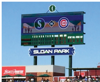
Sloan Park in Mesa, AZ spring training home of the Chicago, Cubs