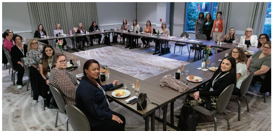
PMI24 Women's Breakfast attendees in Atlanta