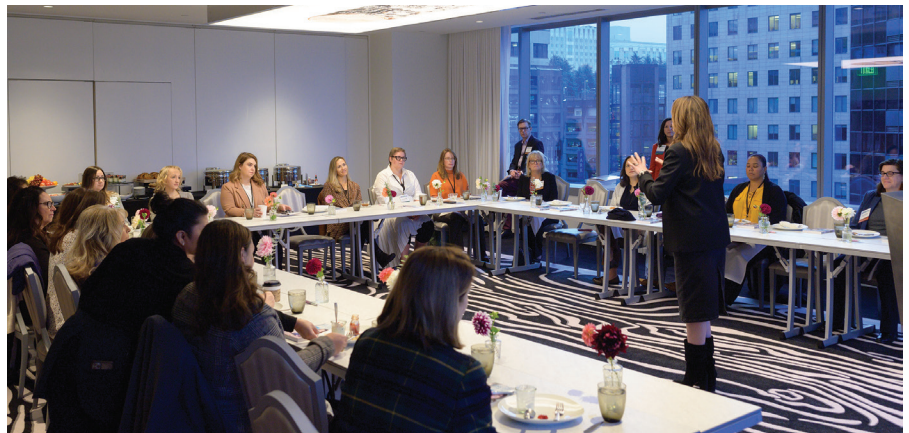
The first PMI Women's Breakfast at PMI23 in Seattle

Stay tuned for more details on the first Women of PMI virtual workshop to take place this summer.