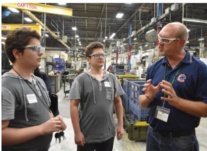
Students tour a Sloan Valve Co. manufacturing facility

The article emphasized how public misperceptions about manufacturing careers continue to persist, and recent research supports that point. While eight out of 10 Americans believe