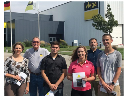
Pratt Community College students visit Viega

Since 2012 – the first year Manufacturing Day launched, the number of events has grown from about 240 to almost 3,000 in 2017. In 2018, 275,000 people participated in nearly 3,000 events across North America, according to the infographic. Manufacturing Day is put together annually by the National Association of Manufacturers with contributions and support from the Manufacturing Institute and Hollings Manufacturing Extension Partnership.