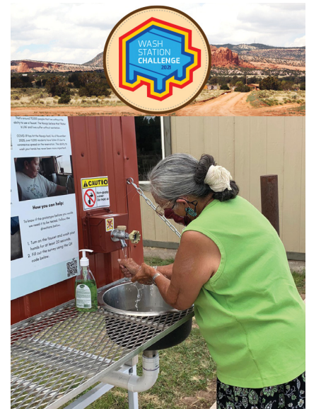
IWSH Wash Station Challenge