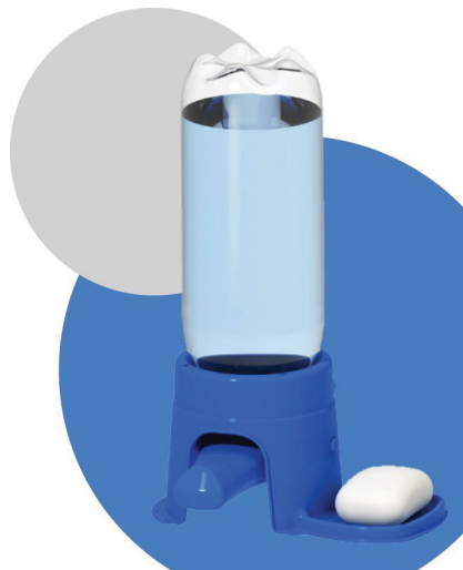
LIXIL's SATO Tap

The International Water, Sanitation and Hygiene Foundation (IWSH), the non-profit arm of PMI member IAPMO, launched its Wash Station Challenge 2021 in June to build mobile wash station facilities for the Navajo Nation in the southwestern United States. Projects