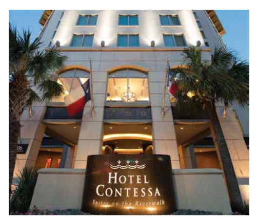
The Hotel Contessa located on the River Walk in San Antonio, Texas is the site of the 2015 PMI Conference

Keep watch online, and via the PMI mobile app, for more details, including full speaker bios, as we draw closer to this event.