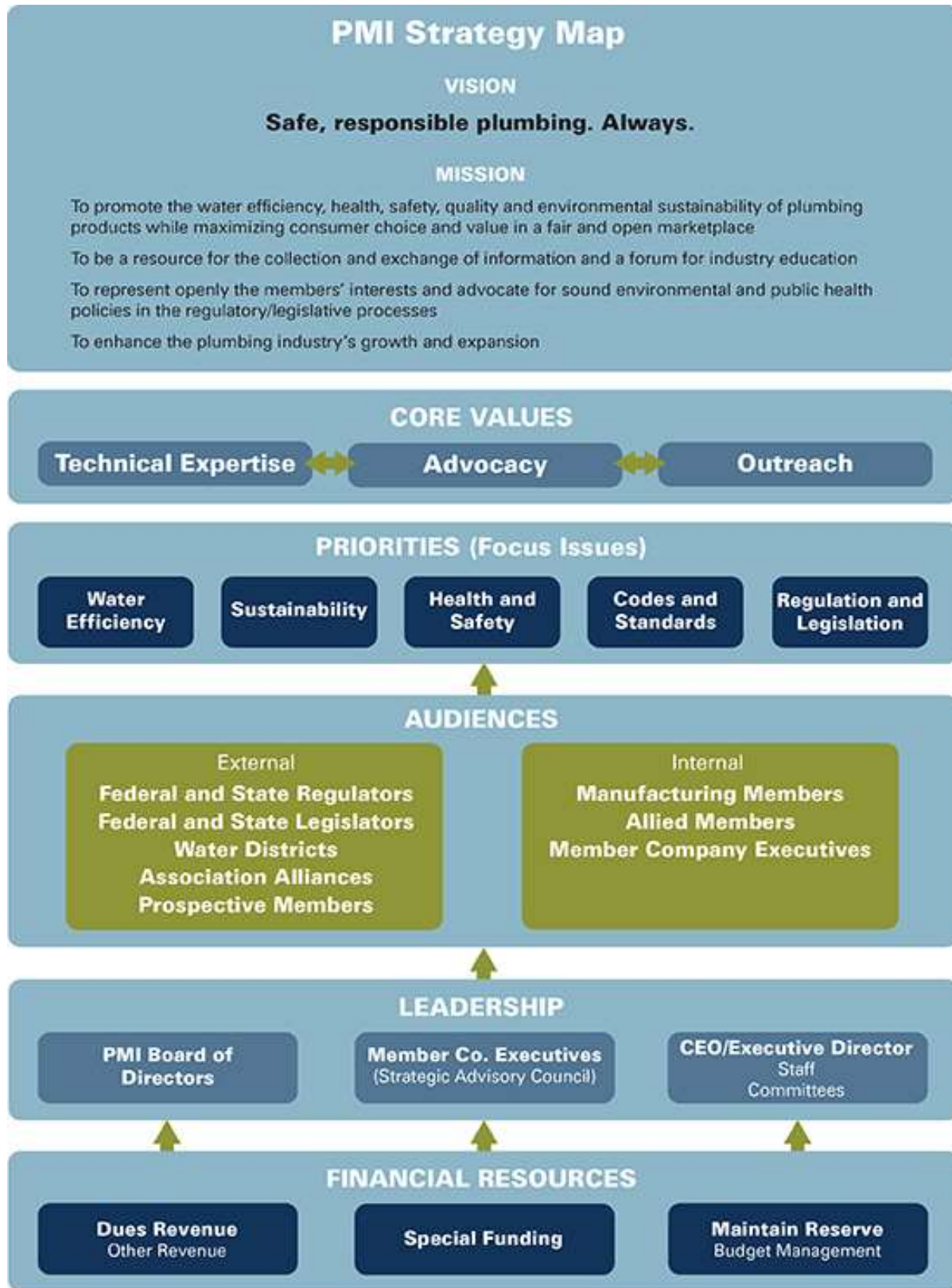
Created June 2012, Revised June 2013, July 2014, and July 2015