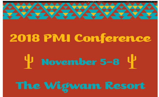
Exhibit packages include: