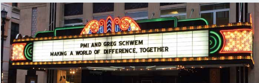
PMI hosted its 2014 Spring Conference at Charleston Place in Charleston, S.C., and its official conference dinner and reception at the hotel's historic Riviera Theater

Check out our Facebook page to see more conference photos