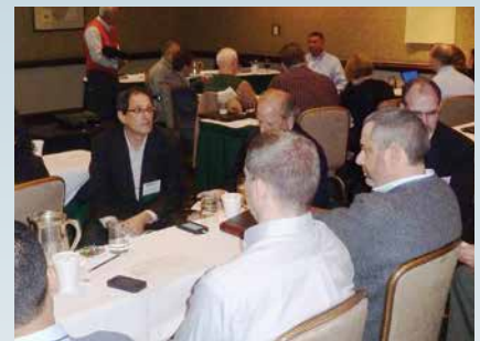
Attendees break into groups during the Technical Track session to conduct risk assessments