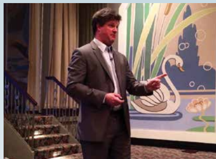
Special guest and corporate personality, Greg Schwem, was on hand to entertain the conference attendees following the Tuesday night dinner and networking