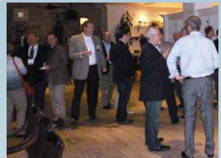
Conference Attendees network at the Welcome Reception prior to the start of the conference