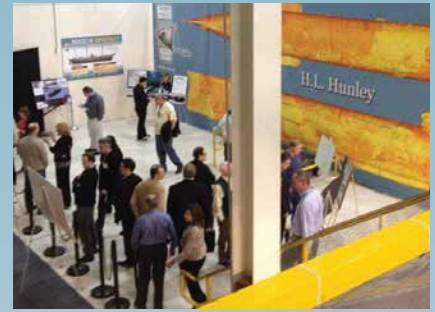
Attendees enjoy a special trip to see the world's first successful combat submarine the H.L. Hunley at the Warren Lasch Conservation Center in the old Charleston, S.C. Navy Base